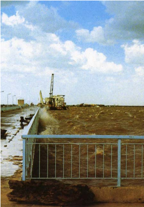
bad weather occasionally caused delay