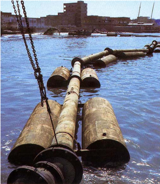
Reclamation of the east embankment